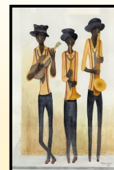
“Jazz Trio” by Roger Huntley

“Music; The Art of Arranging Sound” July 7—September 25