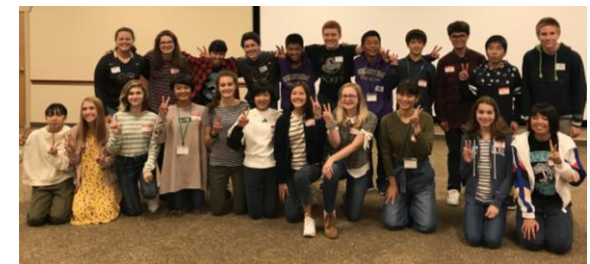
2019 Sequim and Shisô City Exchange Ambassadors at Sequim's Sayonara Party.

Yamasaki Town first established the Sister City relationship with Sequim in 1993. In 2004, following the merger to form Shisô City, the sister city agreement was renewed between Sequim and Shisô City.